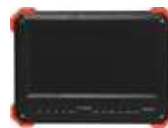
X41T Camera Tester